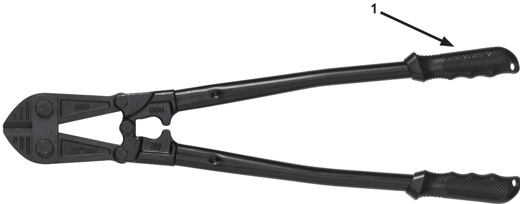
1. Non-slip grip